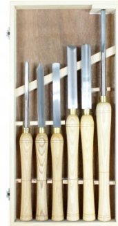
W302 HSS Wood Turning Tools - 6 Piece Set