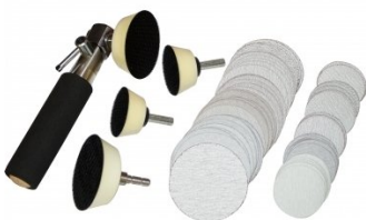
W305 Bowl Sanding Tool