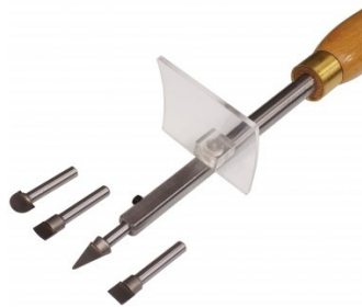
W300 Carbide Wood Turning Tools - 6 Piece Set