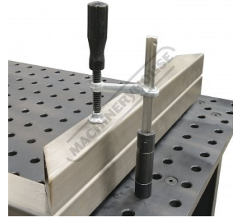
Shown Screwed into Optional Threaded Riser and Adaptor