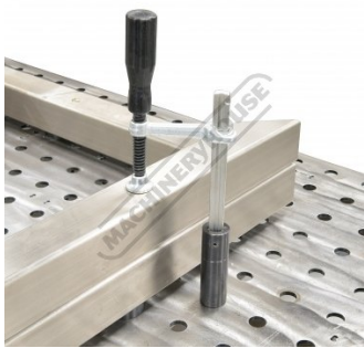
Shown Screwed into Optional Threaded Riser