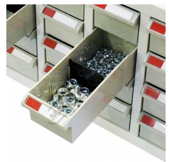
Drawer with Divider Shown with Parts