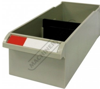
Parts Bin 90 x 218 x 70mm