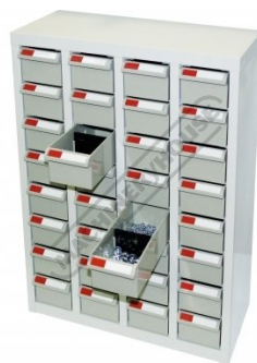
Top View Shown with Parts