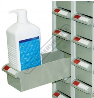
10kg Load With Safety Lip Design