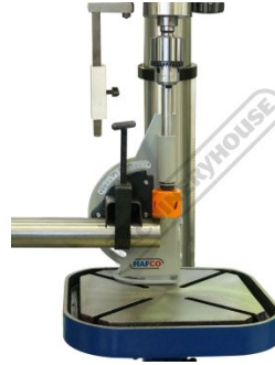
Shown Set Up with Drilling Machine