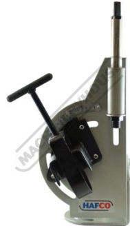
Adjustable Pipe-Tube Clamp