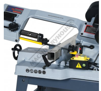
Shown Cutting Steel Tube