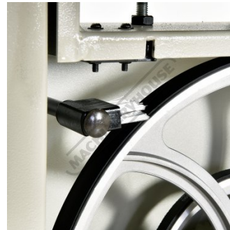
Wheel Cleaning Brush