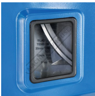
Blade Tension Scale