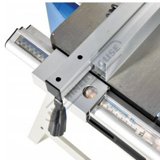
Sliding Rip Fence with High and Low Height Extrusion