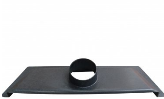
W339 Dust Hose Floor Sweeper Attachment