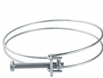
W340 Dust Hose Clamp