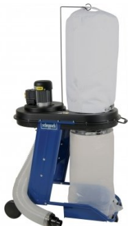
W886 Dust Collector