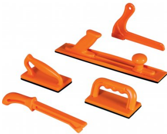
W309 Safety Push Blocks & Stick Set