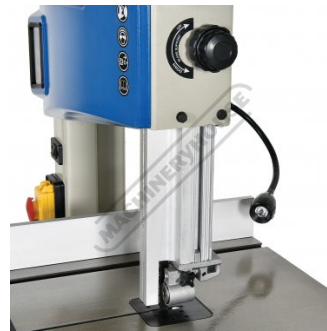
Blade Support Adjustment