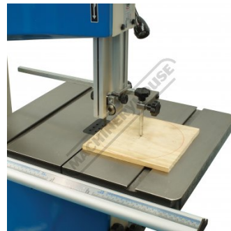
Shown with Optional Circle Cutting Attachment