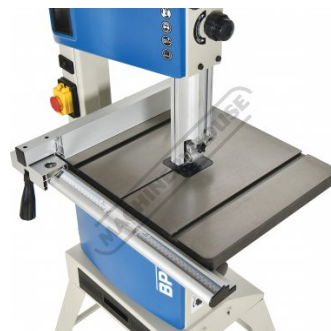
Cast Iron Table with T Slot