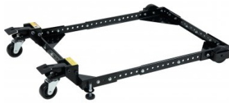
W930 Mobile Base