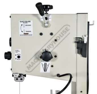
Blade Tension and Tracking Adjustments