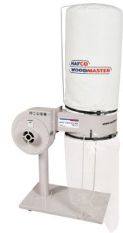
W332 Dust Collector