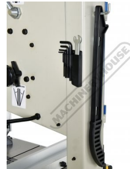
Push Stick and Tools