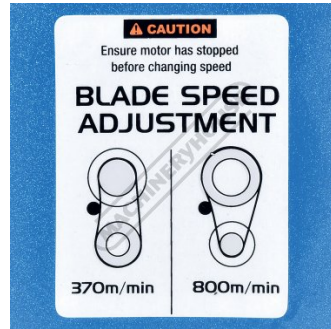
Blade Speed Adjustment