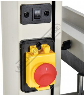
Safety Magnetic Switch and Light Switch