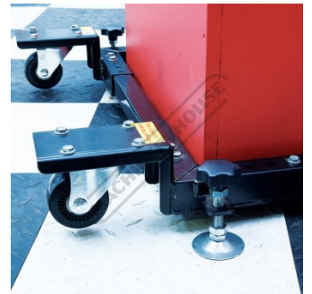
Hand Screw Positioning Lock