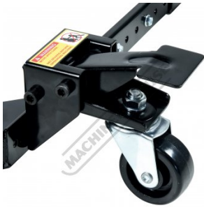
Castors That Swivel 360 Degrees