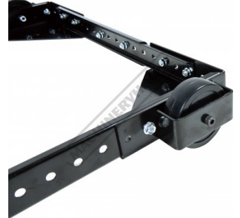
Stable Wheel Design