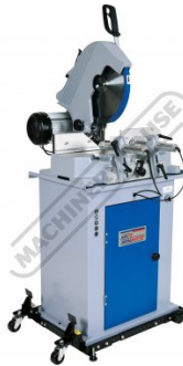
Shown With Machine