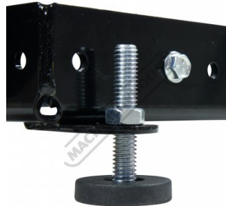
Adjustable Rubber Foot