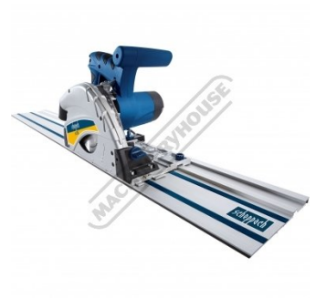
Saw in Up right Position - Shown with Optional Rail