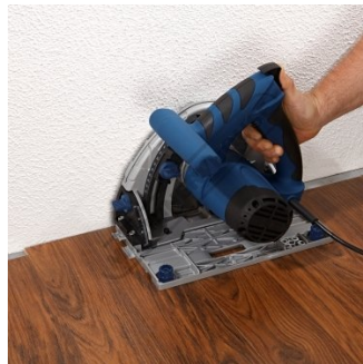
Ideal for edging up to 15.5mm from the wall