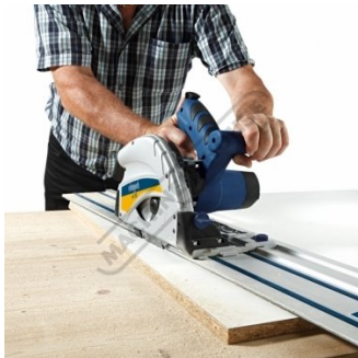
Achieve cuts usually performed on a panel sizing table saw - Shown with Optional Rail