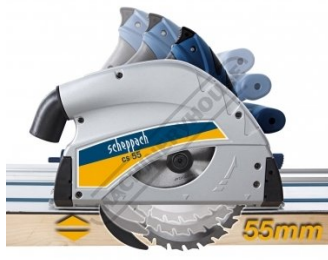
55mm maximum stepless cutting depth