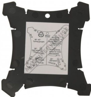
Angle Setting Jig