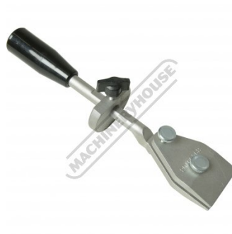
Jig for Knife & Blade Holder