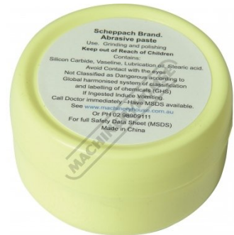
Abrasive Paste For Honing