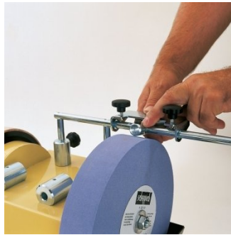
W8633 Wheel Dressing Attachment