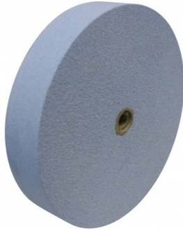
W8630 Grinding Wheel