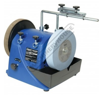
Rear Right View