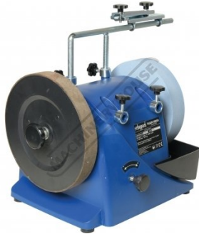
Rear Left View