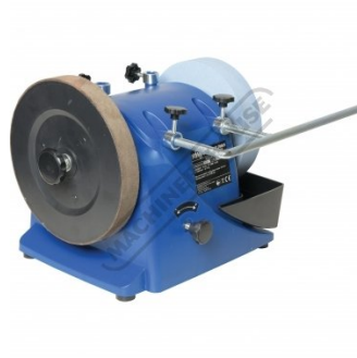
Rear Left View 2