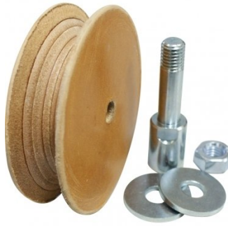
W8632 Leather Honing Disc