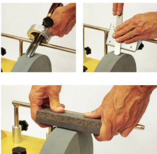
W8625 Jig 55, 110 & Stone Grader Wood Turners Sharpening Kit - 3 Piece Set