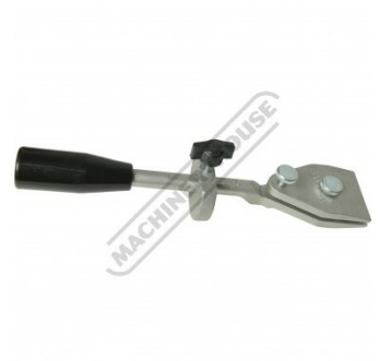
Jig for Knife & Blade Holder