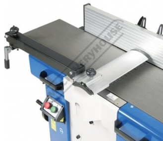
Adjustable Blade Guard