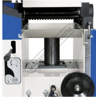
Heavy Duty Central Column Table Support