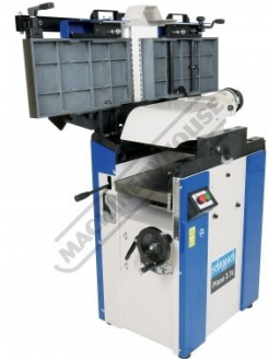
Set-Up For Thicknesser Left View