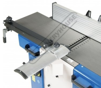
Adjustable Blade Guard Set