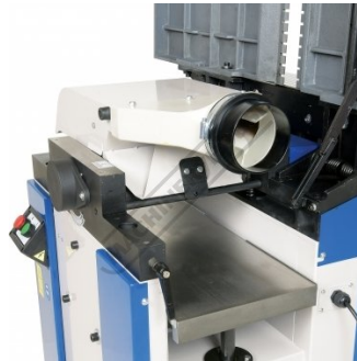
Dust Hood Outlet Shown in Thicknesser Mode