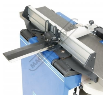
Fence Adjustment Locks