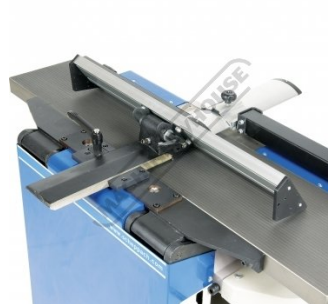
Fence Set-Up at 45 Degrees - Rear View