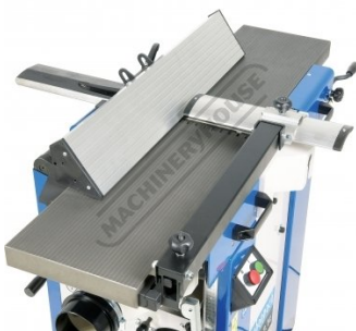
Fence Tilts to 45 Degrees