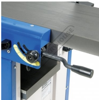
Table Height Adjustment Handle