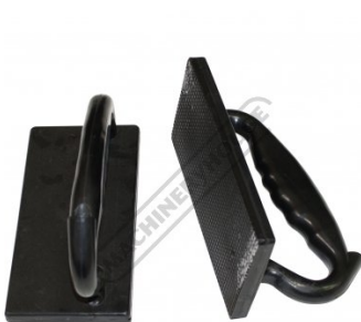
2 x Push Blocks