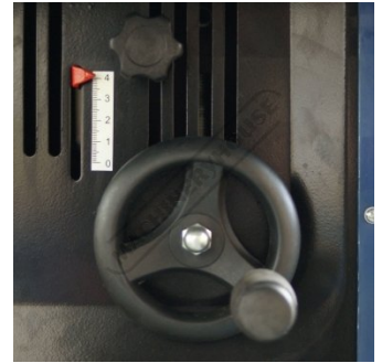
Spindle Height Adjustment