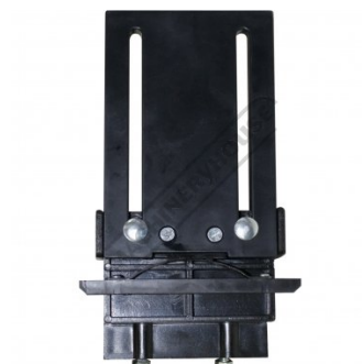
Top Clamp Rear View