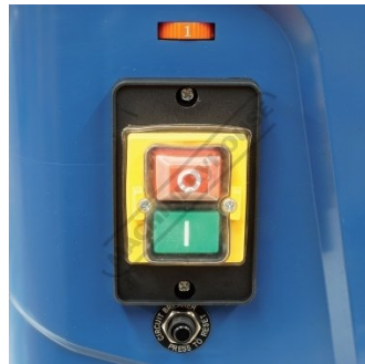
Speed Dial and Switch