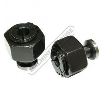
Includes 1/4" & 1/2" Collets