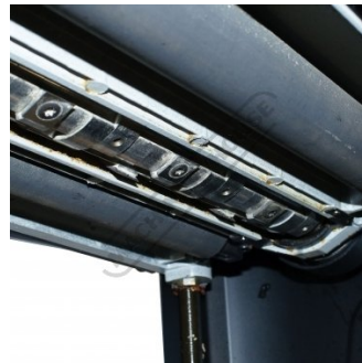
Spiral Cutter Head