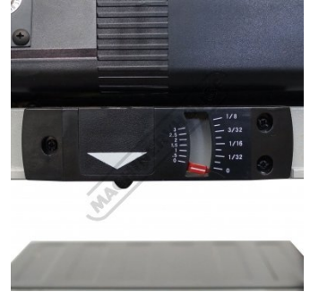
Thickness Depth Cut Indicator