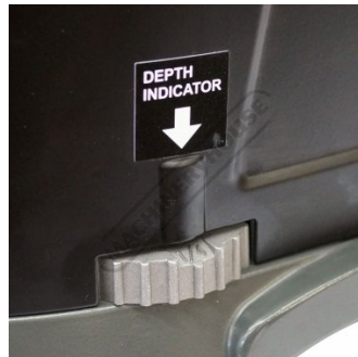
Pre-Set Depth Stop Dial