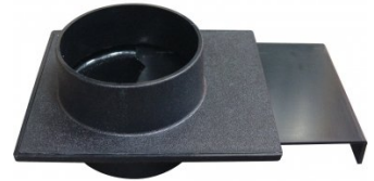
W335 Blast Gate