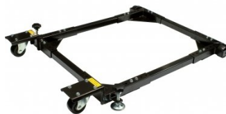
W931 Mobile Base - Heavy Duty