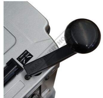
Height Adjustment Handle