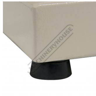
Anti Vibration Rubber Feet