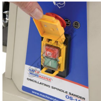
Safety Magnetic Start Stop Switch