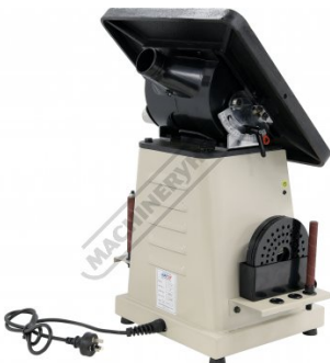
Table Tilted 45 Degrees - Rear Left View