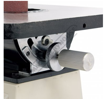
Table Tilt Geared Adjusting Dial & Lock - Left View