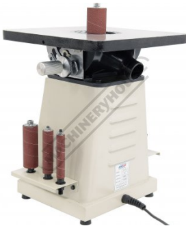
Rear Right View