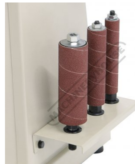
Storage Trays for Sanding Spindles