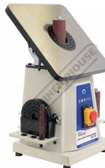
Table Tilted 45 Degrees - Front Left View