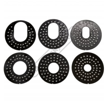
Table Inserts for 90 & 45 Degrees Sanding