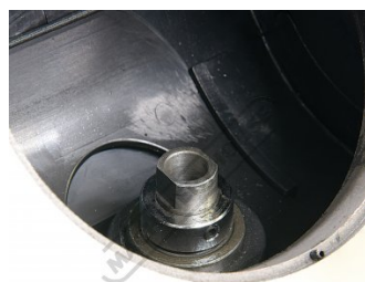
Sanding Spindle Drive Attachment