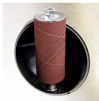
Sanding Spindle Mounted