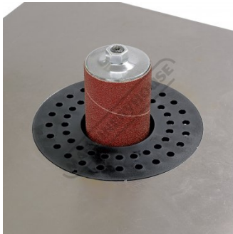
Table Insert for 90 Degree Sanding