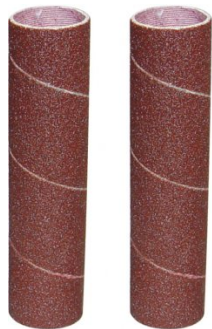
A8118 Bobbin Sanding Sleeves - Pack of 3