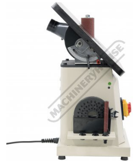
Table Tilted 45 Degrees - Side View