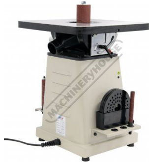
Rear Left View