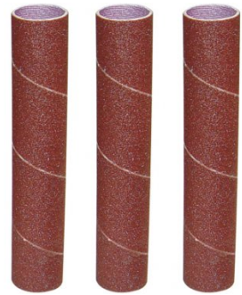
A8114 Bobbin Sanding Sleeves - Pack of 3