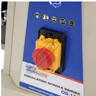
Emergency Stop Switch