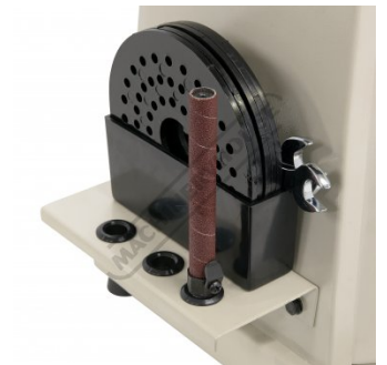
Storage Trays for Table Inserts & Spindles