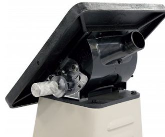
Table Tilted 45 Degrees - Rear View Close Up