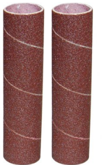
A8120 Bobbin Sanding Sleeves - Pack of 3