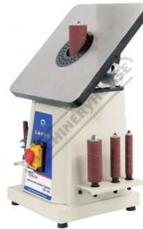
Table Tilted 45 Degrees - Right View