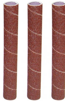
A8112 Bobbin Sanding Sleeves - Pack of 3