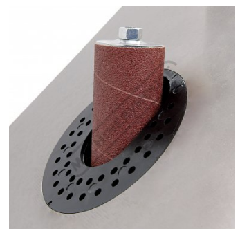
Table Insert for 45 Degree Sanding