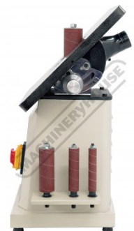
Table Tilted 45 Degrees - Right Side View