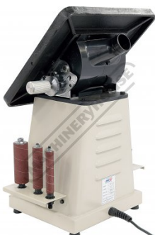
Table Tilted 45 Degrees - Rear Right View