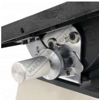
Table Tilt Geared Adjusting Dial & Lock - Right View