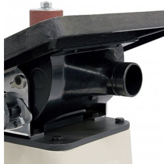
Ø50mm Rear Dust Chute Port