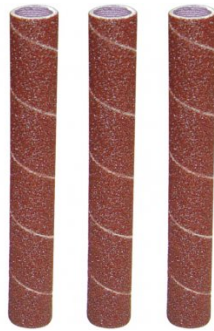
A8110 Bobbin Sanding Sleeves - Pack of 3