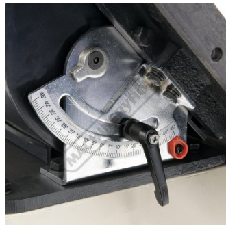
Table Tilt Lock Lever & Angle Degree Scale