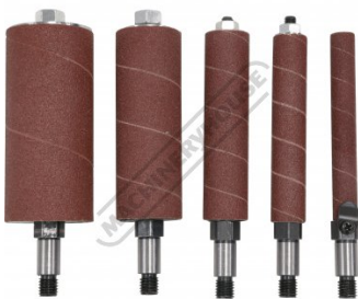
Sanding Sleeves Included