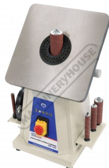
Table Tilted 45 Degrees - Top View