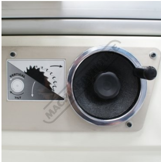
Tilting Arbor to 45 Degrees