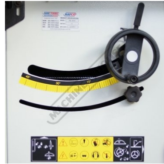
Tilt Gauge 45degrees And Blade Height Adjustment Hand Wheel