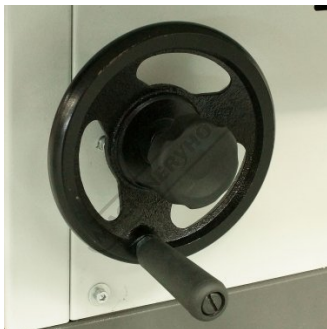
Blade Rise And Fall Handle