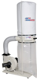
W394 Dust Collector