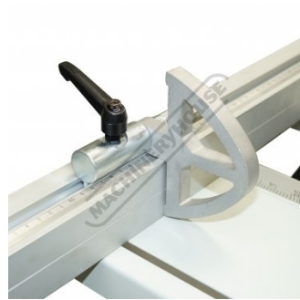
Mitre Guide Fence with Flip Over Stop