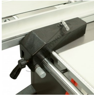
Heavy Duty Rip Fence Guide