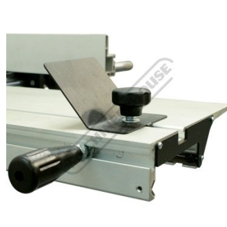
Adjustment Material Stop