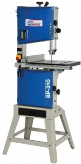
W952 Wood Band Saw