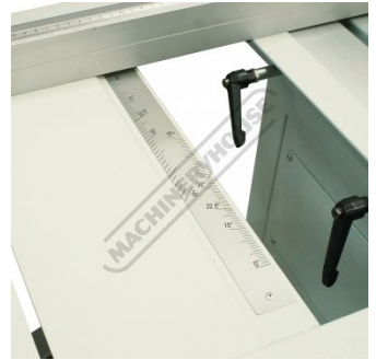
Degree Scale On Sliding Fence