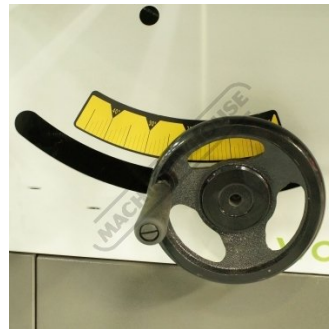
Blade Adjustment Handle