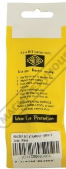
Packaging Rear View