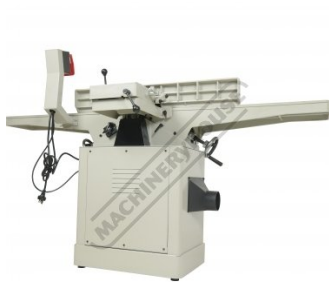
Rear Low View