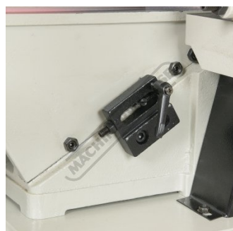
In Feed Table Height Stop Setting