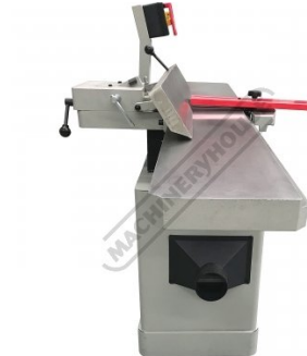
Side View with Fence at 45 Degrees