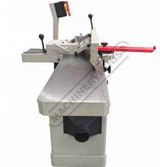
Side View with Fence out