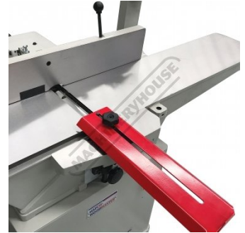
Adjustable Slide Out Cutter Guard