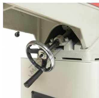
Out Feed Table Height Adjustment