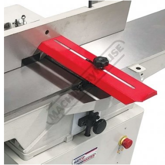
Cutter Guard Adjustment