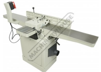
Rear Top View