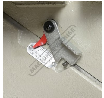
In Feed Table Height Adjustment Scale