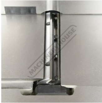
4 Blade Cutter Head