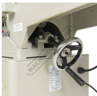
In Feed Table Height Adjustment Handle