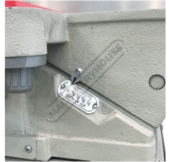
Infeed Table Height Adjustment Scale