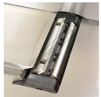
3 Blade Cutter Head