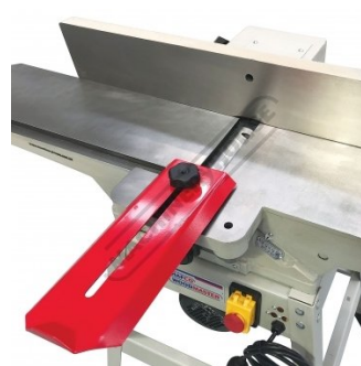
Adjustable Slide Out Cutter Guard