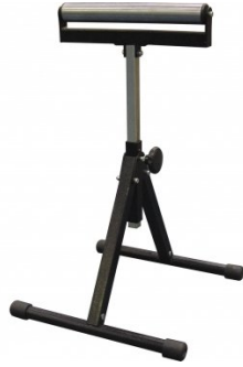
W343A Roller Stand