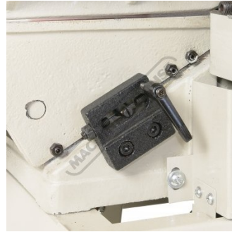
In Feed Table Height Adjustment