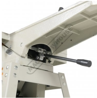
In Feed Adjustable Height Table Handle