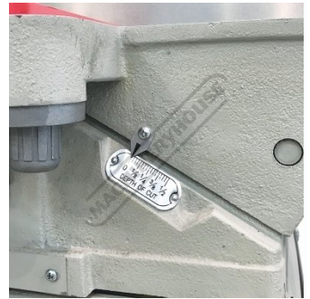
Infeed Table Height Adjustment Scale