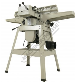
Rear Bottom View