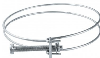
W340 Dust Hose Clamp