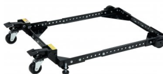
W930 Mobile Base