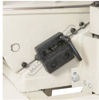
In Feed Table Height Adjustment