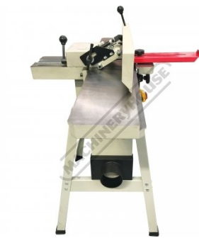
Fence Slide Side View