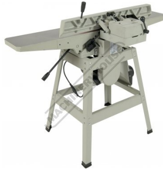
Rear Left View