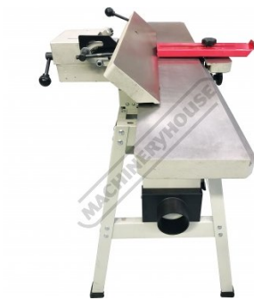
Tilting Fence to 45 Degrees