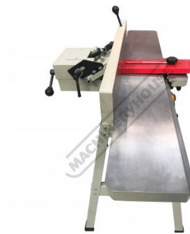
Fence at 90 Degrees