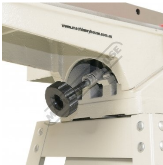
Out Feed Left Table Height Adjustment