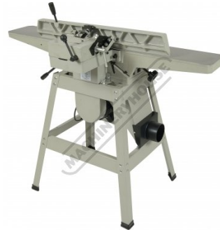
Rear Right View