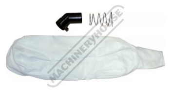
Included Dust Bag