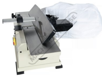
Adjustable Tilting Fence