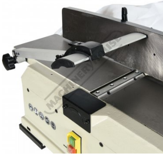
Adjustable Blade Guard