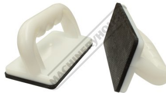
2 x Push Blocks