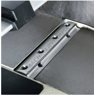
2 Blade Cutter Head