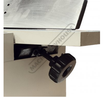
Table Height Adjustment Dial