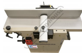
Front Top View