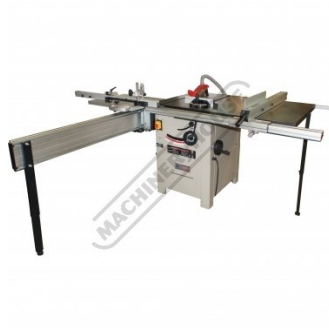
Material Clamp with Adjustable Guide Shown With Optional Table Saw