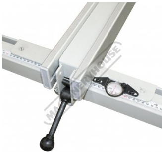
Single Lock Lever on Rip Fence with Magnified Scale