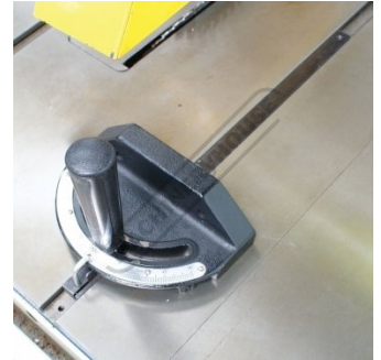
Heavy Duty Mitre Guide 60 degrees