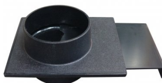
W335 Blast Gate