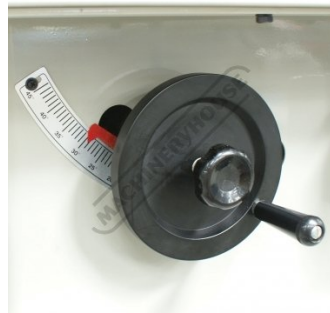
Blade Height Adjustment Handle & Angle Scale