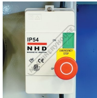
Magnetic Safety Switch