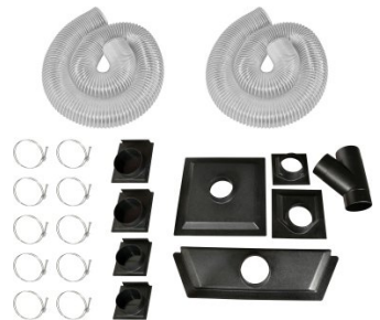
W344 Wood Dust Accessory Kit