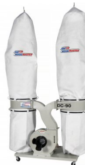
W331 Industrial Dust Collector