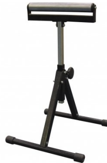
W343A Roller Stand