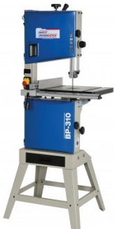
W952 Wood Band Saw