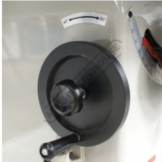
Tilt Arbor to 45 degrees