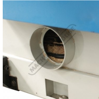
100mm Dust Chute