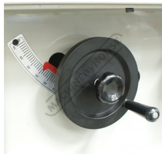
Blade Height Adjustment Handle & Angle Scale