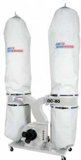
W397 Industrial Dust Collector