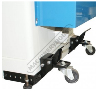
Swivel Wheels on Mobile Base with Leveling Screws