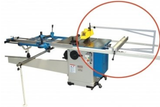
W459 Saw Guard Hood