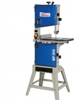
W952 Wood Band Saw