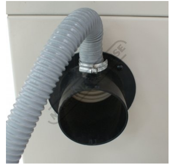
100mm Dust Chute