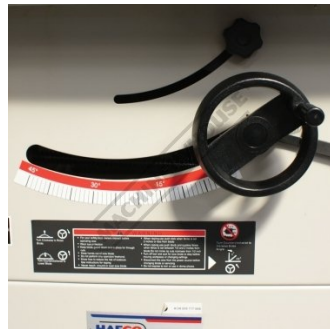
Blade Angle Adjustment