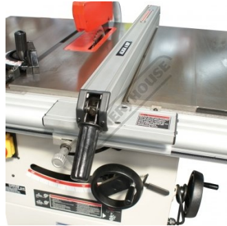
Heavy Duty Rip Fence with Micro Adjustment