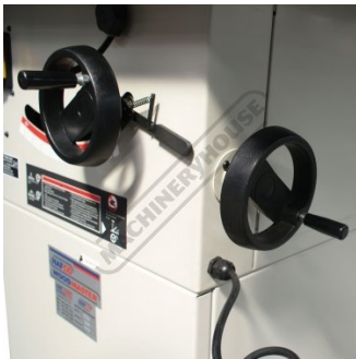
Blade Adjustment Handles