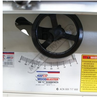
Tilting Arbor Gauge to 45 degrees and Blade Height Adjustment Hand Wheel and Lock