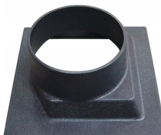
W339 Dust Hose Floor Sweeper Attachment