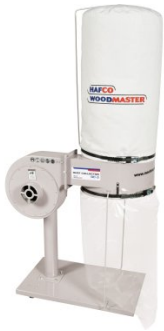
W332 Dust Collector