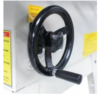
Tilting Arbor Hand Wheel and Lock