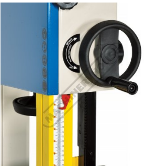
Rack Pinion Adjustment On Top Blade Guide