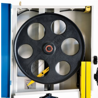
Cast Iron Blade Wheels