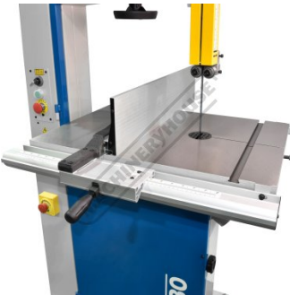
Sliding Rip Fence Up Position