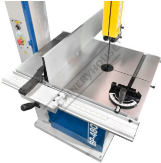
Large Cast Iron Table and Mitre Guide