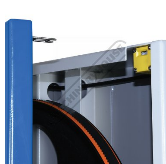
Safety Micro Switch On Door