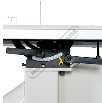
Table Tilt Adjustment