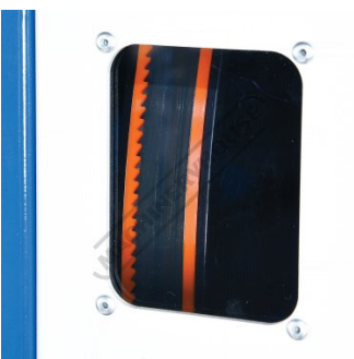
Blade View Window