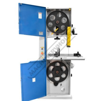
Shown With Blade Door Open