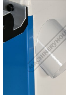
100mm Side Dust Chute