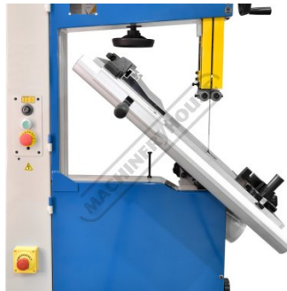
Cast Iron Table Tilts to 45 Degrees