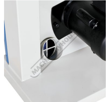
100mm Bottom Rear Dust Chute