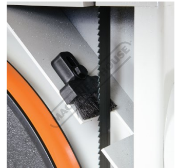
Blade Cleaning Brush