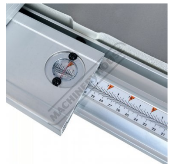
Rip Fence With Magnification Scale View