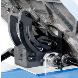
Lower Ball Bearing Blade Guide