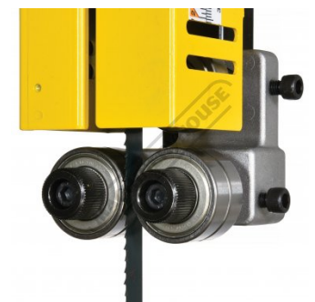
Ball Bearing Blade Guide