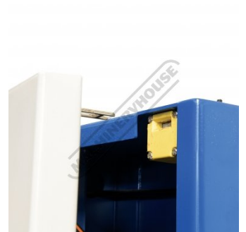
Safety Micro Switch on Doors