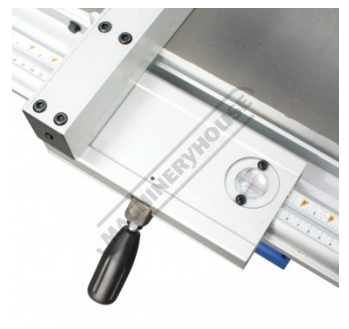
Rip Fence with Magnified Scale View