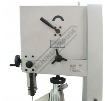
Blade Tension Dial and Quik Action Blade Lever