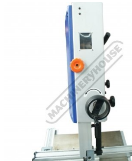
Cut Height Adjustment Dial