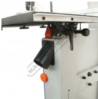
100mm Top Dust Chute