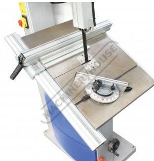
Sliding Rip Fence Table