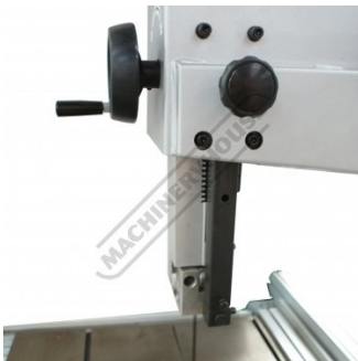
Rack Pinion Blade Guides