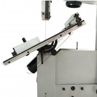
Tilting Table 0 45 degrees