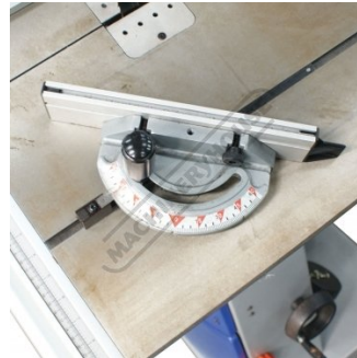
Mitre Guide 0 45 degrees