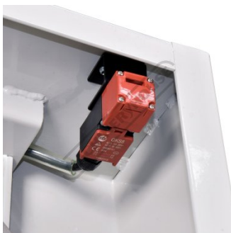
Safety Micro Switch on Doors