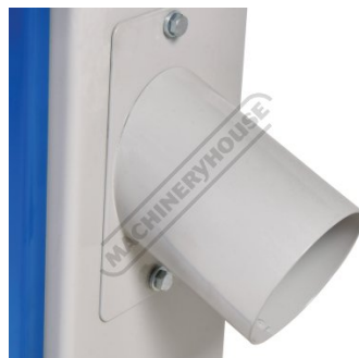
100mm Side Dust Chute