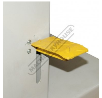
Foot Brake Lever