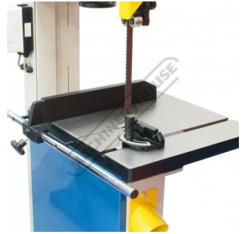
Table with Sliding Rip Fence