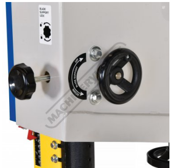
Blade Height Adjustment-Lock