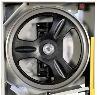
Heavy Duty Cast Iron Wheel