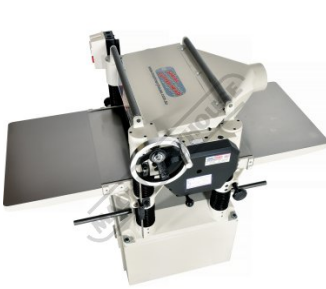
Cast Iron Feed Tables