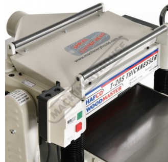
Feed Return Rollers