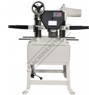
W414 Side View