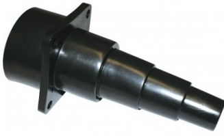
W334A Dust Hose Stepped Reducer