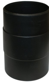
W334B Dust Hose Joiner