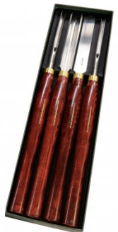
W3039 HSS Wood Turning Tools - 4 Piece Set