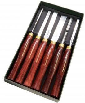
W3036 HSS Wood Turning Tools - 6 Piece Set