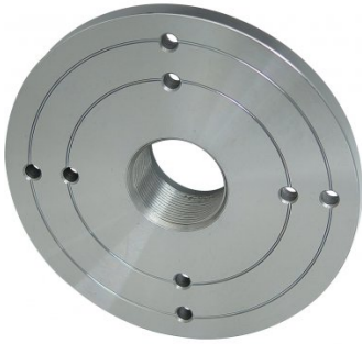
W298 Face Plate