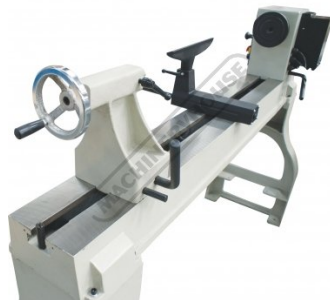
Heavy Cast Iron Legs