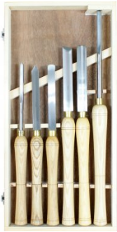
W302 HSS Wood Turning Tools - 6 Piece Set