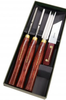
W3034 HSS Wood Turning Tools - 4 Piece Set