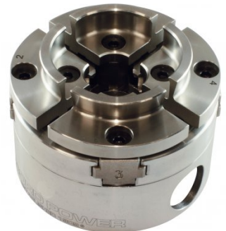
R8198 Scroll Chuck - 90mm - with Bonus 50mm Face Plate Ring