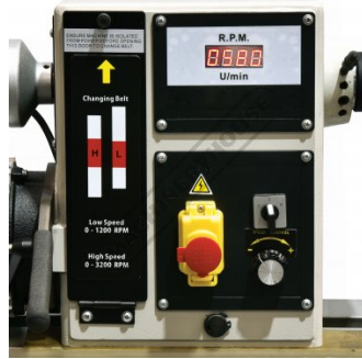
Variable Speed Display