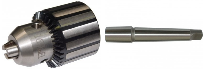
D442A 2MT x JT3 Drill Chuck Arbor