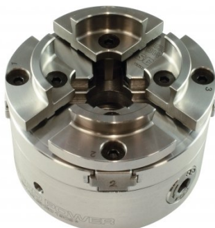
R8175 Scroll Chuck - 100mm - with Bonus 50mm Face Plate Ring