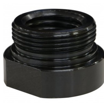
W366 Scroll Chuck Insert - M30 x 3.5mm