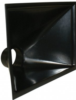
W338B Wood Lathe - Dust Chute - Big Gulp