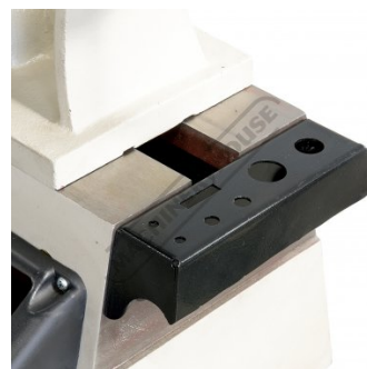
Tool Storage Tray