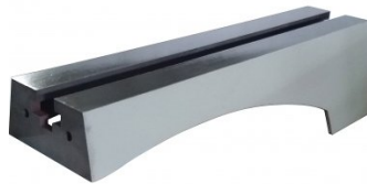
W379X Adjustable Wood Lathe Stand Extension