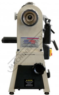
Left End View