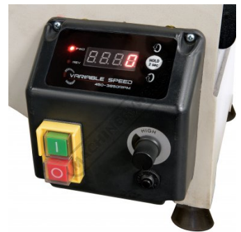
Electronic Variable Speed