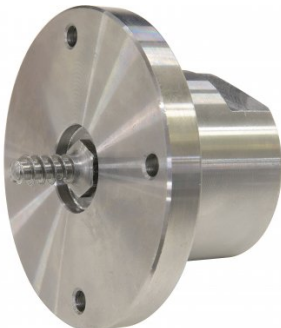
W297 Face Plate