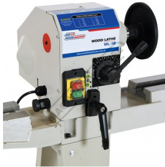
Headstock Left View