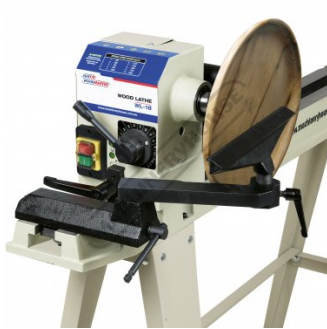
Shown Set Up with Bowl