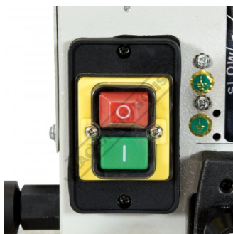
Switch On Off