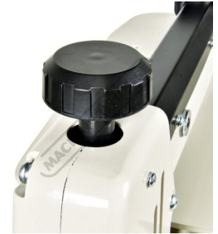
Blade Tension Handle