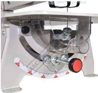
Dust Extraction Chute Tilt Handle