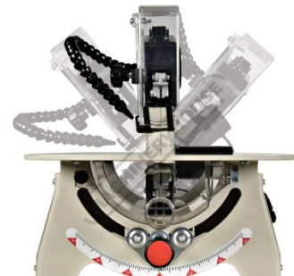
Tilt Head 45 Degrees Left and Right