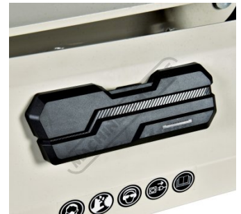
Blade Storage Holder