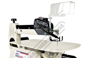
Shown with Safety Guard Raised