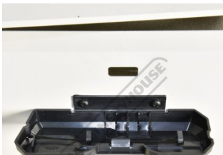
Blade Storage Holder Open