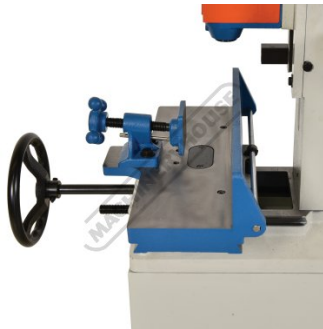
Table Travel-heavy duty device