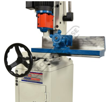
Table movement left and right