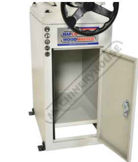
Large storage cabinet