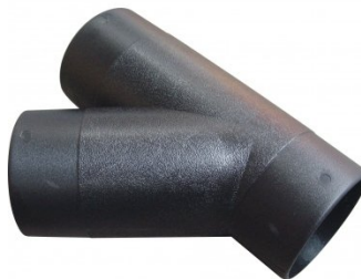
W3375 Dust Hose Y Adaptor