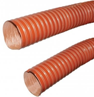
W322A Flame Retardant Dust Hose - Metal or Timber