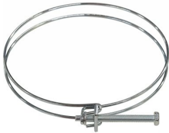
W341 Dust Hose Clamp