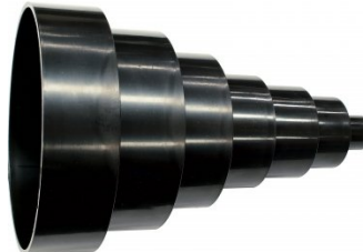
W3346 Dust Hose Stepped Reducer