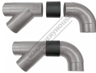
Shown Connecting Dust Fittings Together