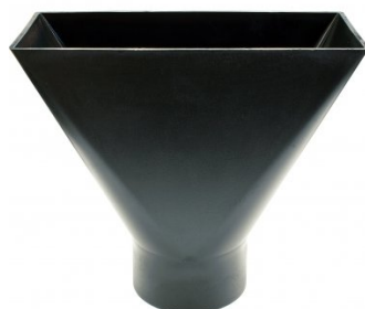
W338A Wood Lathe - Dust Chute Hood