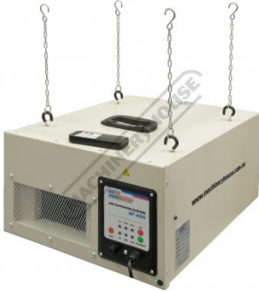
Includes Ceiling Hooks and Chains