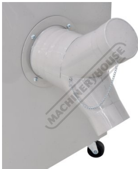
100 Dual Inlets