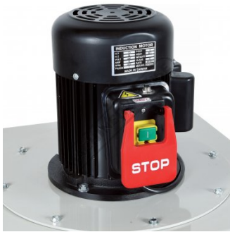
Motor & Safety Emergency Power Switch