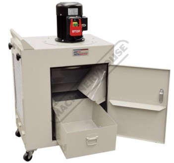
Removable Dust Collection Bin