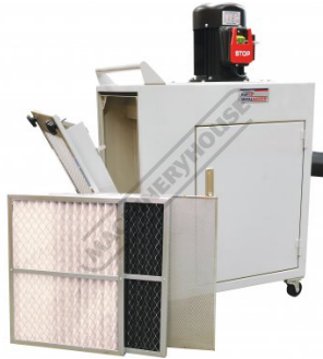
3 Stage Filter System - 1 Micron