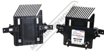
Front and Rear View