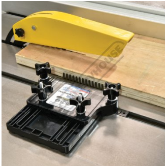
In Use Table Saw