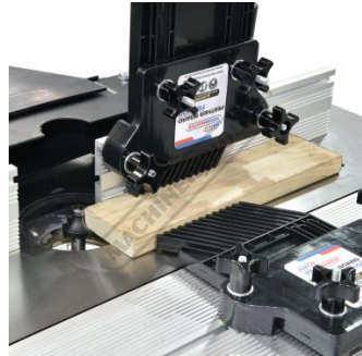
In Use Router Table