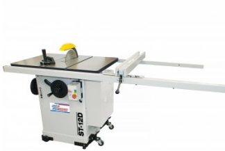
W454 Table Saw