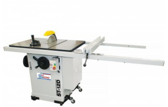
W455 Table Saw