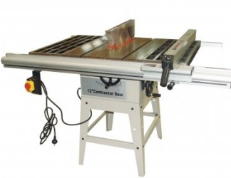
W452 Table Saw