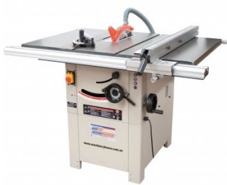
W486 Table Saw