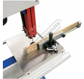
Shown on Wood Bandsaw