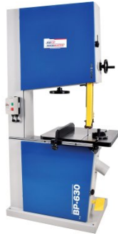
W429 Wood Band Saw