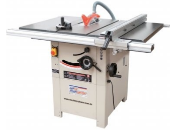
W486 Table Saw