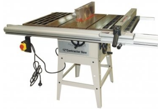
W452 Table Saw