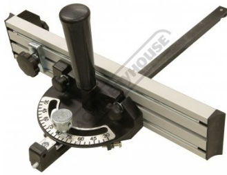
Fence Fully Closed