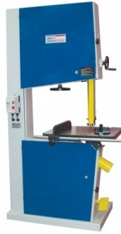
W429 Wood Band Saw