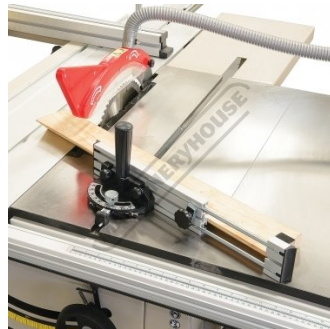
Shown on a Table Saw