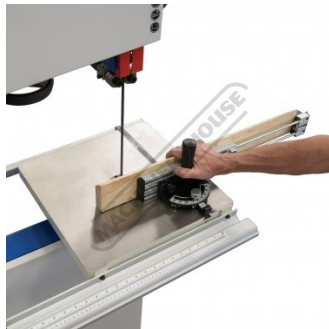
Shown on a Wood Bandsaw Action