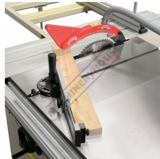
Shown on a Table Saw Side View